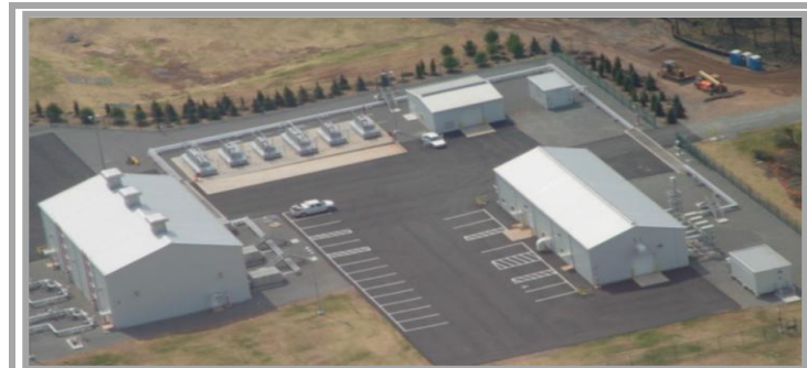
Typical natural gas compressor station